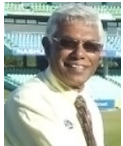
Umpire Co-ordinator in KZN

Twenty six umpires attended the Indaba (includes those from Port Shepstone, Umzinto, Stanger, Eshowe and Richards Bay).