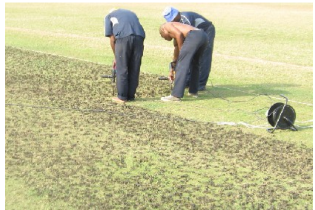
Pitch drilling at Tills Crescent

square, hoping to provide more space and bounce to the surface. The Delta ground at Tills has had its drilling and dressing done in the last week of May, Rovers commenced on 7 June and DHS Rhythm will follow on 23 July. The dates for Crusaders and Pine-town are still to be confirmed.