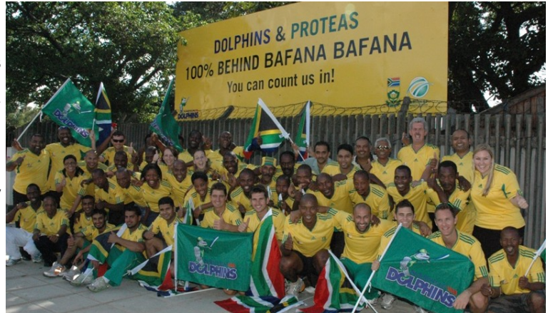
KZN Cricket Union staff & Dolphin players supporting Bafana Bafana