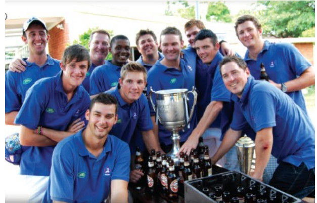
Crusaders Winners of Premier League 2009/2010

The due date for surveys to be handed in is the 10 June '10. A Club workshop will be held on the 02 July '10 to discuss the feedback received.